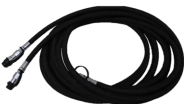
HYDRAULIC HOSE 25'