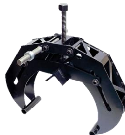
PIPE CLAMP up to 12"